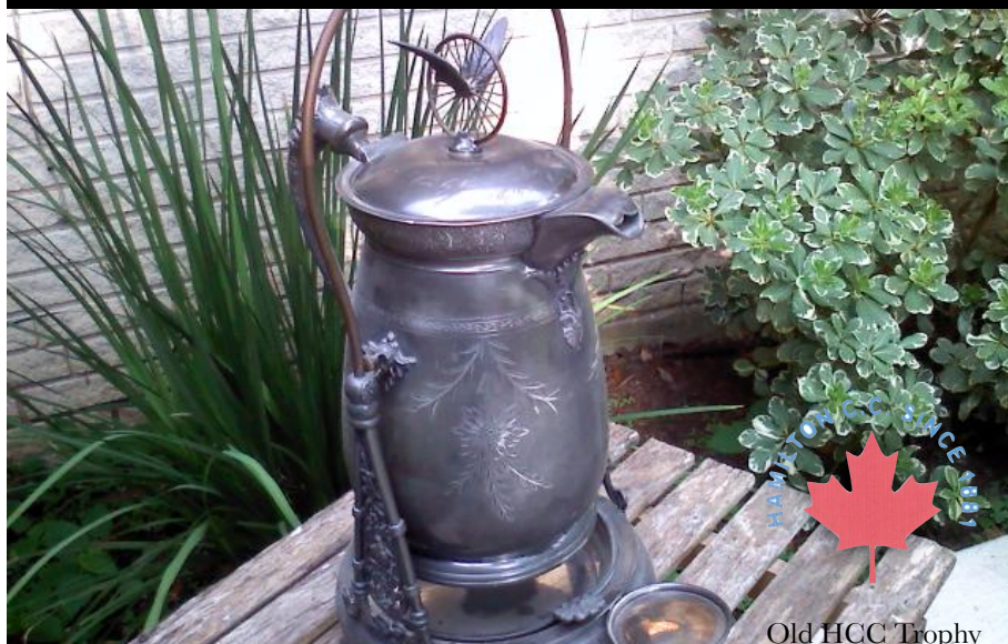
Old HCC Trophy