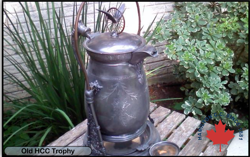
Old HCC Trophy

----- Any member of the H.C.C. who breaks any of the current standing records will have the following year membership paid by the club, and an award at the banquet! Good luck and Remember to always push yourself!