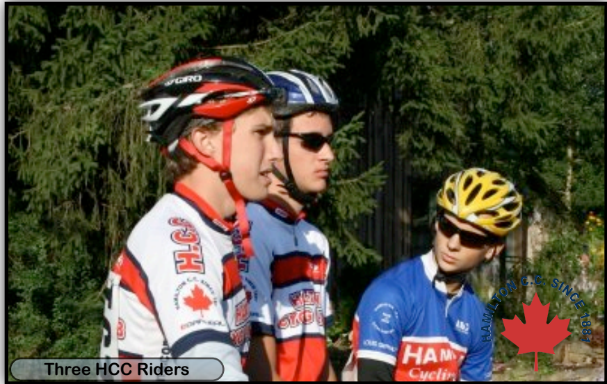
Three HCC Riders